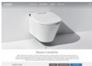
AXENT NEW WEBSITE