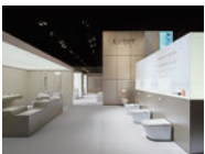
AXENT ISH 2017 SHOWROOM