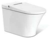
AXENT.ONE C PLUS